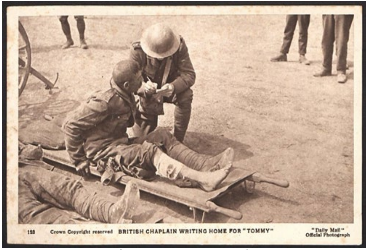
"BRITISH CHAPLAIN WRITING HOME FOR TOMMY"