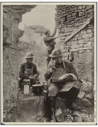
Soldiers manning a portable trench phone, 1917–18