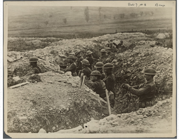
Troops in a trench, 1917-18 DOWNLOAD

<u>Trench Warfare</u>, The National WWI Museum and Memorial <u>Life in the Trenches of World War I</u>, History.com <u>Life in the Trenches of the First World War</u>, Imperial War Museum