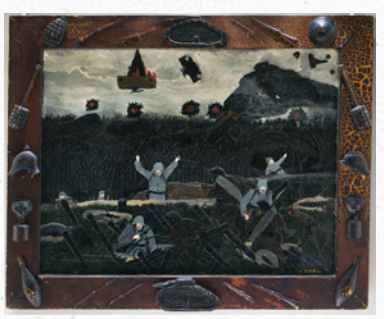
Dogfight Over the Trenches, 1935, by Horace Pippin, Hirshhorn Museum and Sculpture Garden, Smithsonian Institution DOWNLOAD