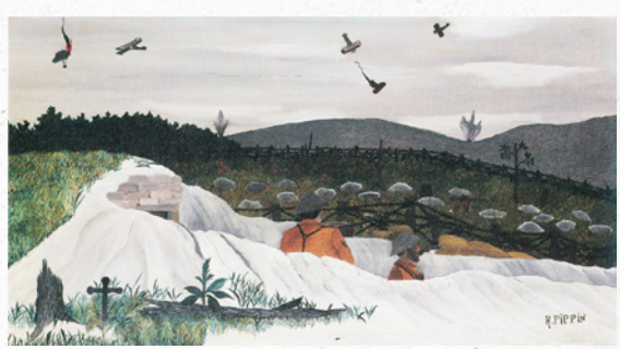
The Ending of the War, Starting Home, 1930-33, by Horace Pippin, Philadelphia Museum of Art DOWNLOAD

As shown in The Great War , Horace Pippin sustained a near-fatal injury in September 1918 during the Meuse-Argonne Offensive. A bullet shattered his right shoulder and caused him to lose full use of his dominant right arm. When Pippin returned to the U.S., he faced not only the racism and employment and housing discrimination widely encountered by returning African American veterans, but an additional burden: widespread bias against people living with disabilities. During his time as a soldier, Pippin wrote a journal of his wartime experience, which included hand-drawn illustrations of scenes from the war. After returning home, he again turned to art, this time as part of his physical therapy. He began selling painted cigar boxes to make extra money and also experimented with burning images into wood panels before turning to oil painting. His first solo art exhibition was in 1937, and within a year several of his paintings were included in a Museum of Modern Art exhibition. Despite having no formal art training, Pippin became a widely exhibited folk artist, whose work was sought after by museums and collectors. His subject matter varied, but a number of his paintings depict scenes from World War I.