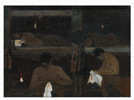
Study for "Barracks," 1945, by Horace Pippin, Philadelphia Museum of Art DOWNLOAD