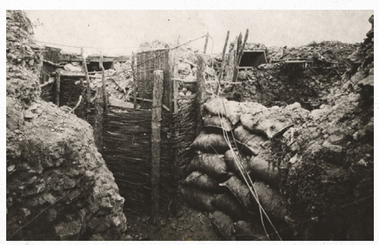
Interior of a trench with hurdles and barriers, The National WWI Museum and Memorial