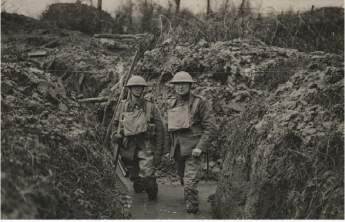
British soldiers standing in water in a trench, The National WWI Museum and Memorial DOWNLOAD